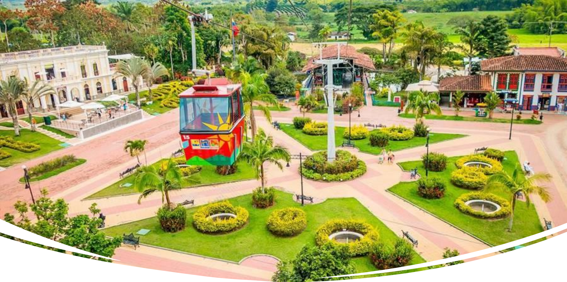
Parque del Café.