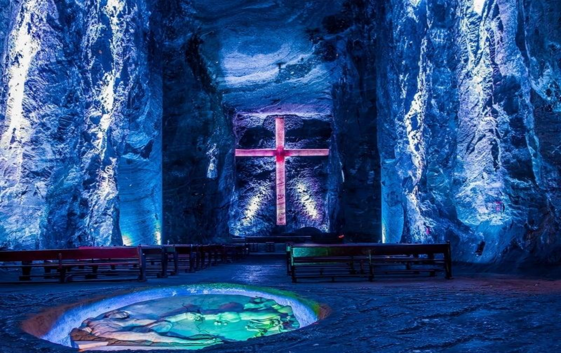
Catedral de Sal de Zipaquirá.