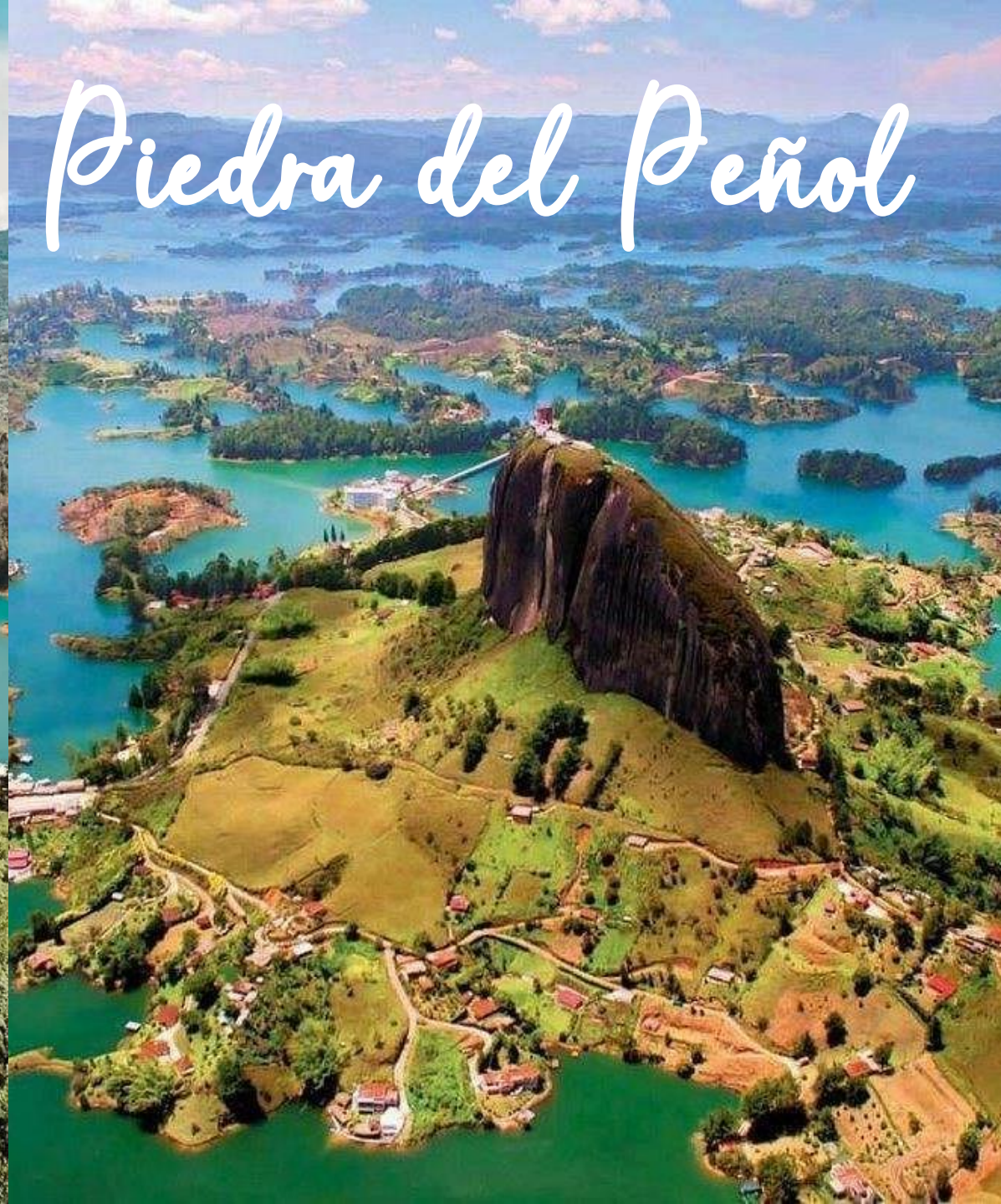
Piedra del Peñol